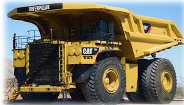
Earth Moving Equipment