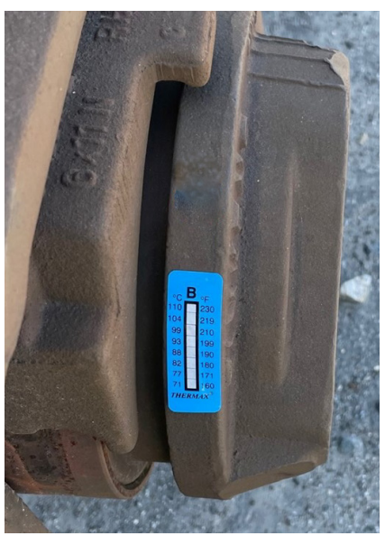
Strip applied to bearing cup